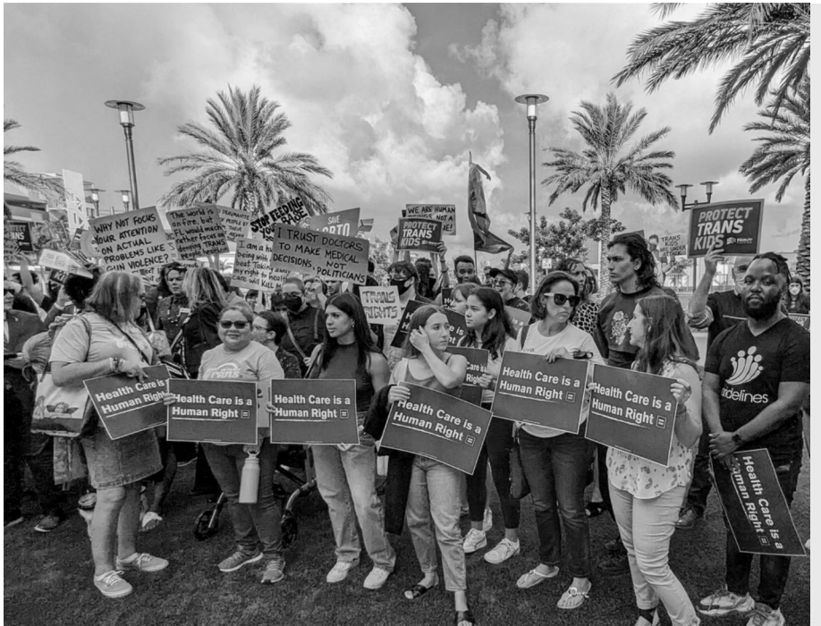
Lawsuit Suggests Zealotry Disguised as Medicine Led to Denial of Medicaid Coverage for Trans Treatments miaminewtimes.com

That much mention of my other qualifications.